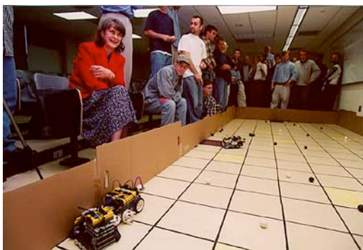
Figure 5. Capture-the-Balls Competition. Later competitions allow dangling of RCX IR Towers over the playing field for better remote-control approaches.

The second stage required students to write a “Remote RCXLisp” program that sent remote-control messages to a Mindstorms robotic arm mechanism to move pieces in an 8-Puzzle according to the solution developed by stage 1’s programming. It was in this stage that students discovered that the search space reformulation trick ultimately cost them in the complexity of the translation their second program had to perform on the “move space” operator list to “move tile at (2,2) to (2,1)” types of commands.